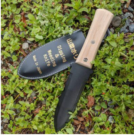
Hori hori knife available at Russell Nursery