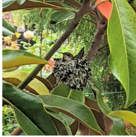
Anna's hummingbird on her nest at Russell Nursery.

If you are wondering how to feed and nourish the wildlife in your garden come talk to one of our staff and we would be happy to help you in your selections.