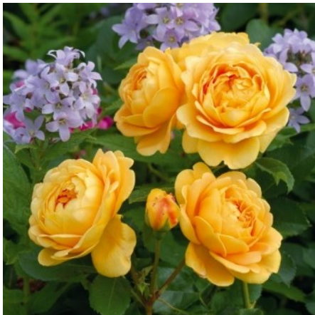
'Golden Celebration' rose

It's bare root rose season! We still have quite a large selection of bare root roses to choose from, but they're a hot item so don't wait too long. We have floribundas, grandifloras, Hybrid Teas, climbers, Flower Carpet and David Austin roses to choose from. Find more information here on the different types of roses.