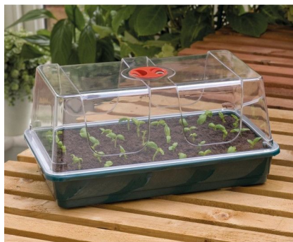
Garland propagator and tray this spring.

From sighting the first sprout of green to harvesting delicious and healthy ingredients to compose your supper, being involved in food production gives a rare sense of power and well-being. Seed starters have a hand in creating life and, through cultivating and consuming the food they grow, can also be confident that they know where their food came from, how it was grown, and that it is nourishing.