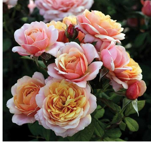
'State of Grace' - New 2020

Send us an email , call (250-656-0384) or drop by the nursery to pre-order.