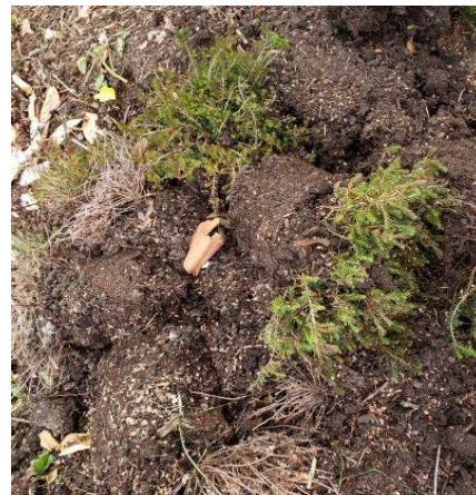
Pile of heather plants dug up for under-performing.

Hint: look at the root balls. Clearly they were just popped out of their pots and plopped into the ground to die.