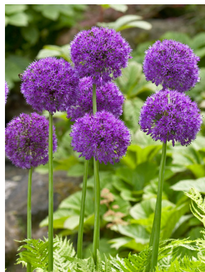
Allium 'Purple Sensation'