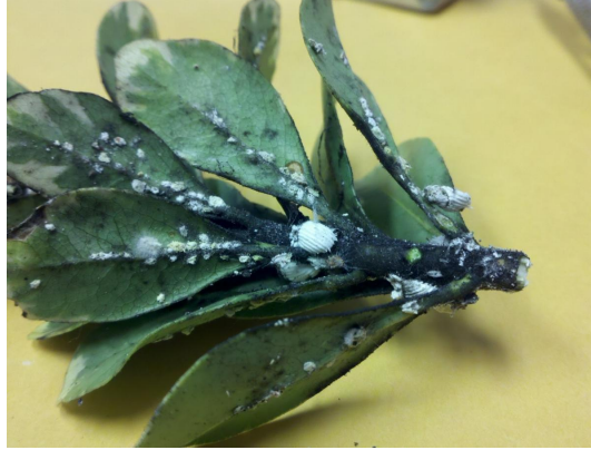
Sooty Mold and Scale on Pittosporum

First, it is important to correctly identify the problem . Look for signs and symptoms. If you need help , please come talk with us or email us a photo . For small