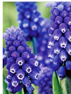
Muscari 'Dark Eyes'