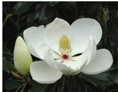
Magnolia 'Little Gem'

Evergreen magnolias love the sun, rich moist soil with good drainage and protection from harsh winter winds. Many varieties can grow to a good size within ten years (about 30' tall and 15-20' wide) but there are also more compact varieties that are well suited to smaller residential gardens.