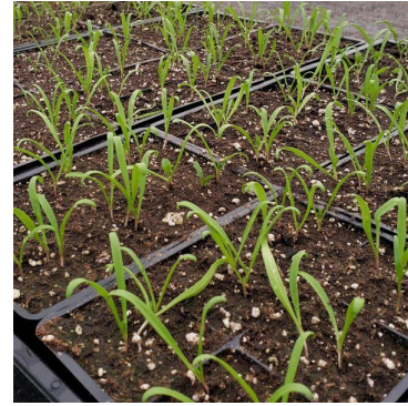
'Samish' spinach seedlings

Their favourite variety is Samish , and Faye has seeded lots of it for sale this fall! If you've been waiting for starts the seedlings are now ready to leave the nursery .