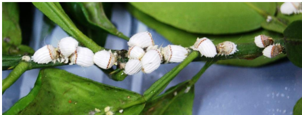
Cottony Cushion Scale

problems, you can attempt to control the pest through physical removal (pruning out the worst branches). For larger infestations, scale can be controlled through the application of horticultural oil sprays . This can be applied in summer or when the plant is dormant. Note that application in