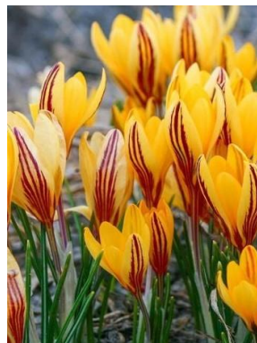
Snow Crocus 'Early Gold'