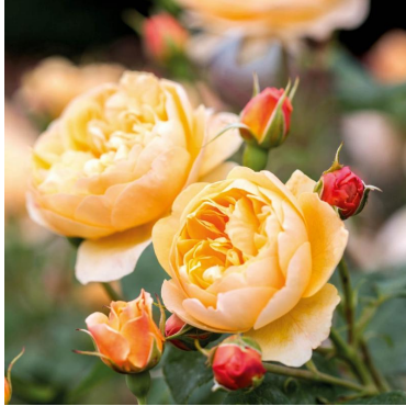
Roald Dahl