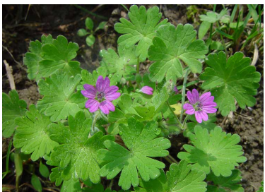
Common weed: dovefoot geranium

Please report any suspected sightings here .