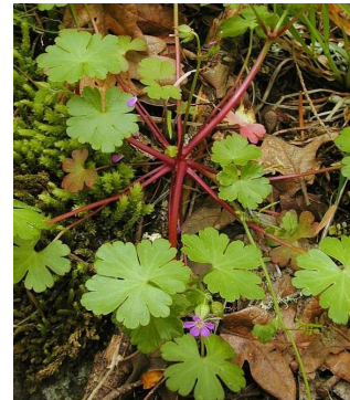
Invasive plant: shiny geranium

On the topic of invasive species , have you seen this plant? Shiny geranium ( Geranium lucidum ) is a very recent introduction which the province is trying its best to eradicate. This plant has the ability to quickly colonize an area choking out all other growth. It forms a dense mat, can shoot seeds up to 20 ft away and has 5 generations per year! Click here for more info.