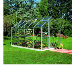
Halls Greenhouse: Popular 106

To make an appointment please call 250-656-0384 or email: russellnursery@telus.net