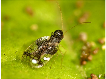
Adult andromeda lace bug

offspring suck plant juices from the underside of leaves which creates a yellow-speckled appearance and can cause leaf drop in very stressed plants . Pieris sited in hot sunny spots are more at risk because lace bug predators live in the shade.