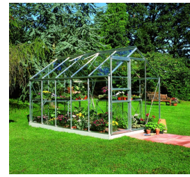
Halls Greenhouse: Popular 106

To make an appointment please call 250-656-0384 or email: russellnursery@telus.net