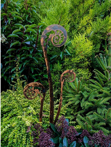
Fiddlehead fern by Roz Stanton

located in Pemberton and creates beautiful flora and fauna figures in acid washed steel to add points of interest to the garden.