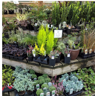
Plants for four-season containers.