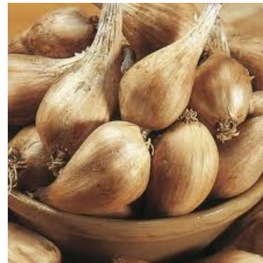
French Grey Shallots

We are also excited to be selling organic French Grey Shallots this year. Locally grown on Salt Spring Island, these French heirloom shallots are a culinary delight and are considered a favourite by gourmet chefs. Plant some this fall to enjoy next summer.