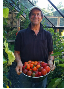
October harvest from the greenhouse

To make an appointment, please call 250-656-0384 or email russellnursery@telus.net