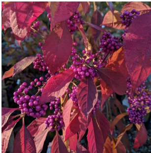
Callicarpa 'Purple Giant' for winter colour.