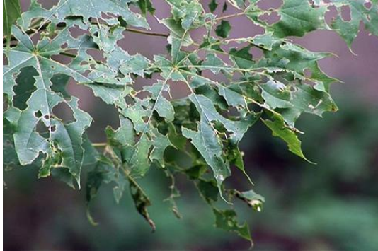
Damage caused by winter moth larvae.