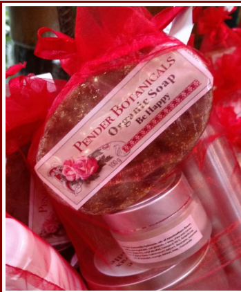
Zoe Landale Pender Botanicals

Birds and botanicals are the focus of this collection of garden art and ornaments.