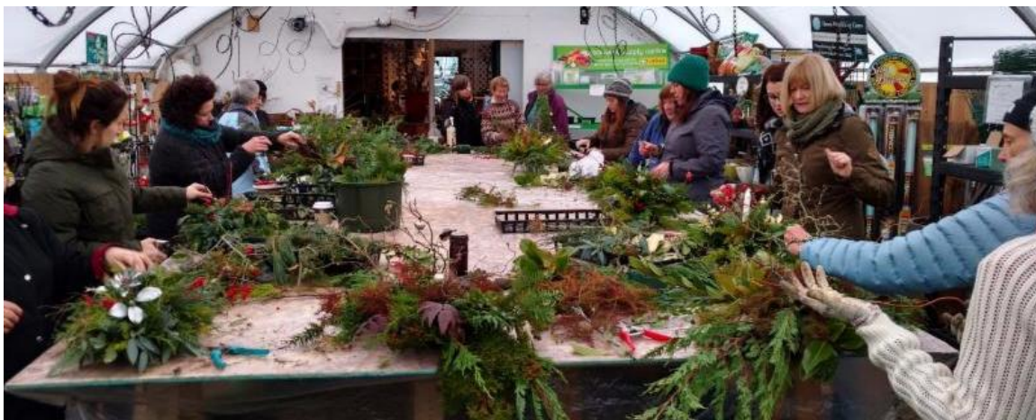
Fun making holiday arrangements!

If you like to make your own, you'll find everything you need right here - wire frames, moss, bundles of greens and all the trimmings.