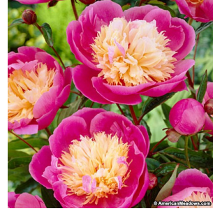
'Bowl of Beauty'

Mature clumps of peonies have an air of old world charm about them. They invoke visions of garden parties and ladies in big hats. They have substance and a sense of permanence. Not surprising really, considering that peonies last practically forever; 50 - 100 year plants are common in old gardens.