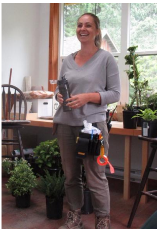
Fun for staff too!

(You can limit your Facebook activity to being a member of this group if you don't otherwise want to be on Facebook.)