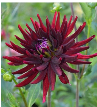
Dahlia 'Chat Noir'

Like so many other things, plants come in and go out of fashion. Dahlias and roses both fall into this category. The last couple of years we've noticed a renewed interest in both, and for good reason. They give us a lot of pleasure, with minimal effort, over a long season.