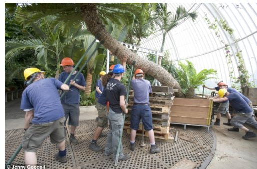
It's possible to re-pot anything if you have enough help!