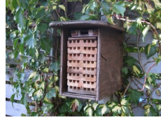
Place your Bee Condo in a sheltered site

Mason bees are naturally occurring, but it doesn't hurt to give them a boost and provide them with accommodation handy to their work site!