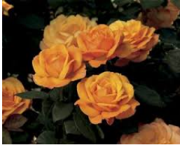
New from Weeks - 'Good as Gold'

Mason bee condos and bees are available at the nursery. Search our website under Articles to find lots of info about these hardworking creatures.