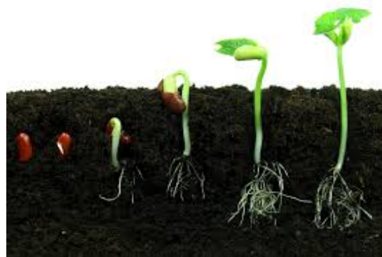
It's amazing what a seed can do!

Whether you sow your own seeds or buy starts from the nursery, your seedlings will go through a vulnerable stage of babyhood, when you must meet their every need. Just follow these simple guidelines and benefit from lessons we've learned along the way.