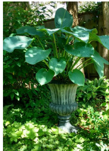
Hosta 'Empress Wu'

Colourful containers sprouted up everywhere when we moved to our current home and I suddenly had lots of sun. My long pent up desire for pots overflowing with petunias and other summer beauties could be indulged almost endlessly. A few years later, the novelty wore off a little - it was a lot of work to plant up all those pots every year; time to look at alternatives. Perhaps a single, perfect specimen instead of a riot of colour... Read On