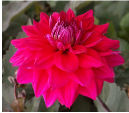
Dahlia 'Suffolk Punch'

hanger and nestle into an empty pot for instant flower power.