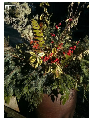
Cut branches in a big urn

After the holidays take out the red berries if you like, but leave the rest. Cut evergreens stay fresh outside for a long time. In early spring replace the boughs with potted bulbs or primulas.